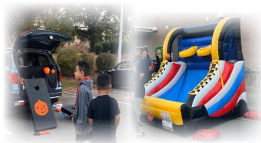
Fall Festival 2023